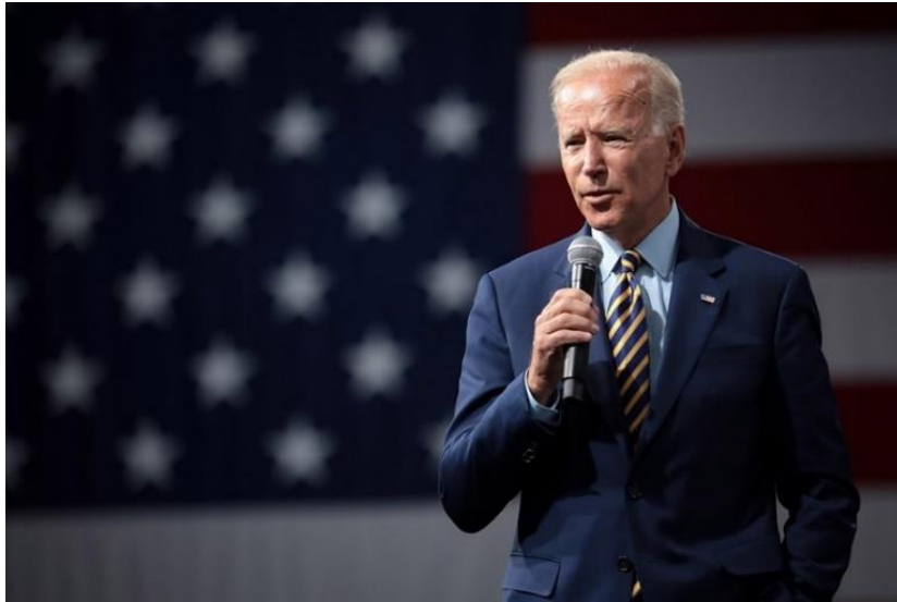
조 바이든 (Joe Biden) 미 대통령 당선인

그럼에도 불구하고 바이든과 그의 팀은 그들이 원하는 출발점이 어디인지 알고 있다. 바이든은 미국의 "핵심 가치"를 다시 새롭게 하기 위해 "결단적인 조치"를 취할 것이라며 미국이 다시 한번 모범을 보임으로써 힘을 발휘하도록 할 것이라 말했다. 그는 대통령 임기 초기에 민주주의 국가들간 정상회담을 개최하여 국제 민주주의를 재건하는 것을 대표 의제로 삼고 있다.